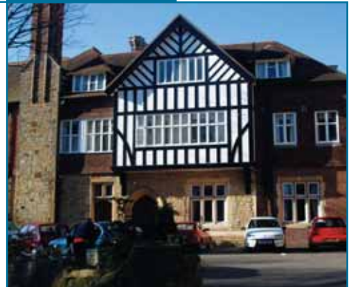
Bannow Care Home, Hastings