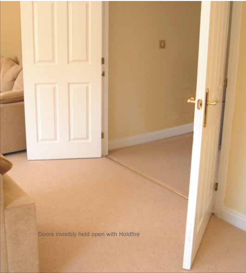
Doors invisibly held open with Holdfire

Simple to use, the Holdfire systems have been developed specifically with older people in mind for ease of use without the pressing of switches or plungers.