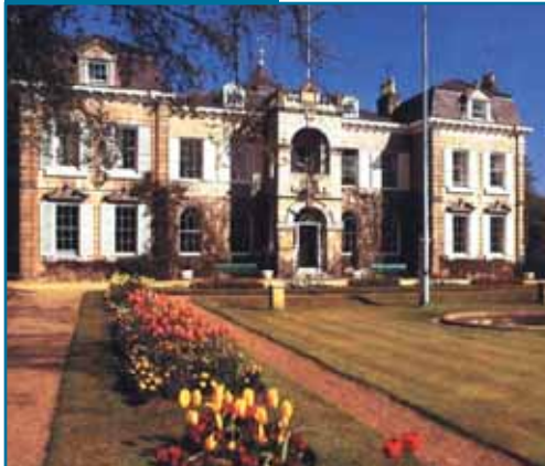
St John's Residential Home

"We chose Holdfire because it preserves the look of the building and allows my residents to have their doors open without breaching fire regulations"